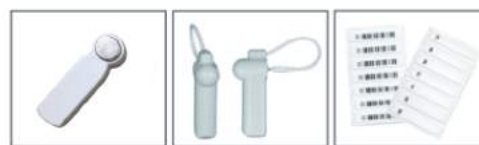
AM Hard Tag 1 AM Hard Tag 14 AM Soft Label 1