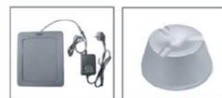
AM Deactivator AM Detacher